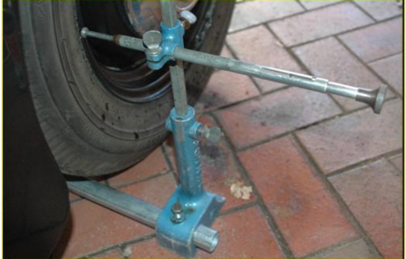
As can be seen in the above photos the centre line of the wheel is the starting point for the measurement. I repeated the process this time without rotating the wheels in order to see if the rims were true and they were. Assuming that all adjustments have been done correctly and everything else is in proper order the steering wheel spokes should be symmetrical in the straight ahead position.