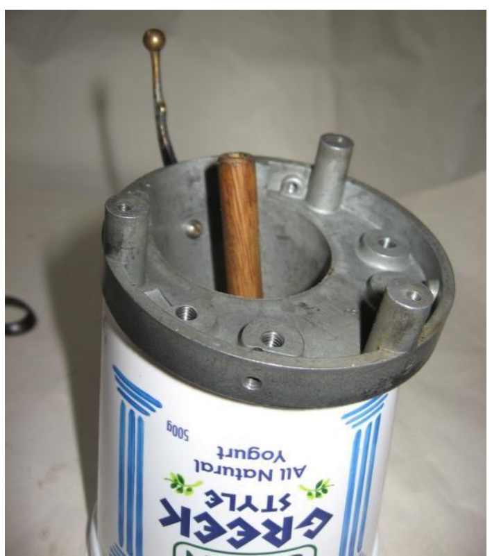
of the dowel of sufficient diameter to insert the bottom end of the drive spindle. Insert the dowel into the lower cup race and pack the balls around it. This stops them being dislodged and falling through the centre and onto the floor (again).

Filling the bottom race is fiddly and can be made easier by fashioning a dowel about 4" long that just passes through the lower bearing cup. Drill a hole up the centre