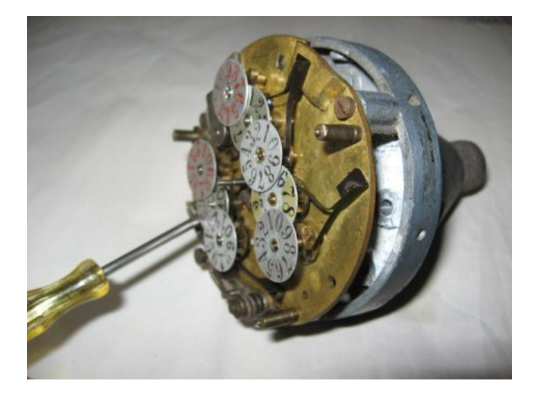
With dial and hand removed the chassis remains secured to the body with 3 screws. Screwdriver indicates location of adjustment for drive spindle end float.