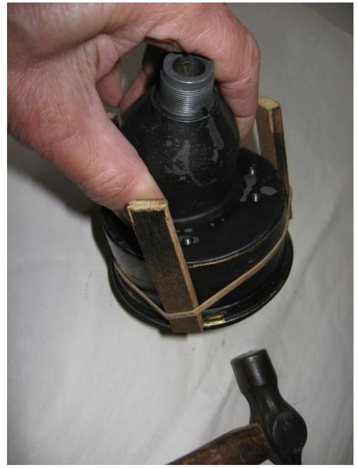
Separating the bezel from the body.

pressure as close as possible to the mounting boss. I ground a "V" notch in an old screwdriver (well, it's old now).