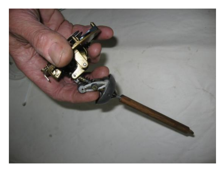
With the spindle engaged in the chassis top bearing use the dowel to help lower the assembly into the instrument body...

The rest of the reassembly is exactly as per Haynes manuals. Cut a new paper gasket to fit between the bezel and glass. This will help to keep moisture out and prevent the glass rattling.